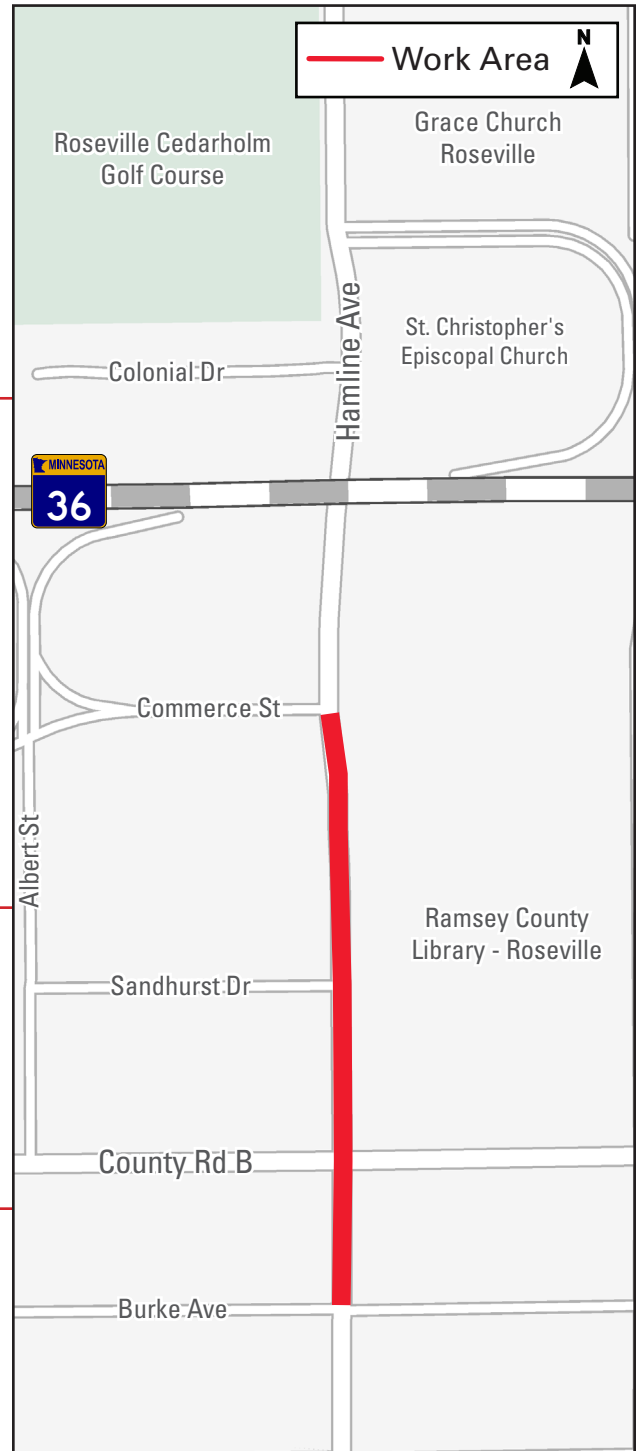
This map is a graphic and may not show exact locations.